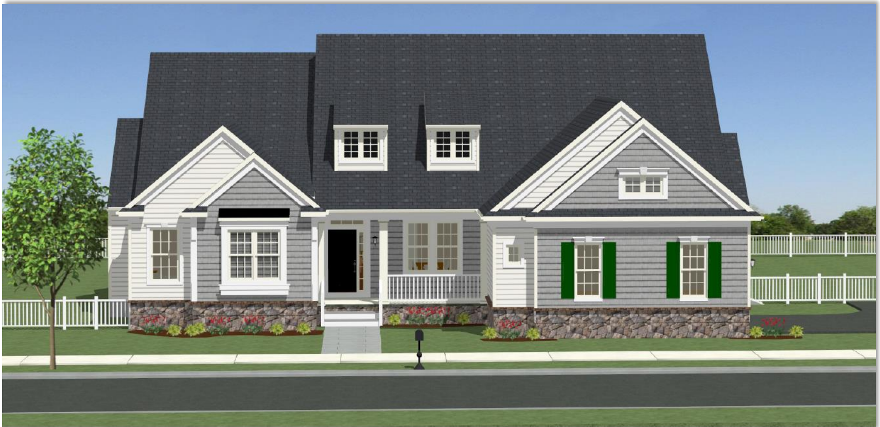
Side Entry Garage Elevation

Elevation renderings may depict features which are not standard on all models. Renderings are for illustrative purposes only.