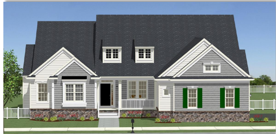
Side Entry Garage Elevation

Elevation renderings may depict features which are not standard on all models. Renderings are for illustrative purposes only.