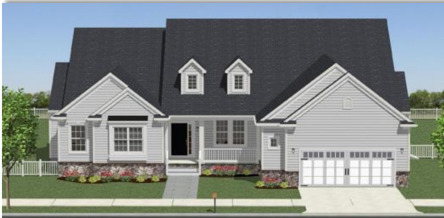
Front Entry Garage Elevation